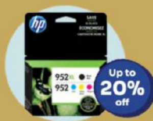
Ink & Toner